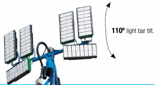
110° light bar tilt.

The hydraulically/electrically operated light towers reach a maximum height of 10.2 metres with light bar tilt of 110° and rotation of 350°, all controlled from the ground. One-man operation of both tower and lights significantly reduces the likelihood of handling injuries when compared to manual control.